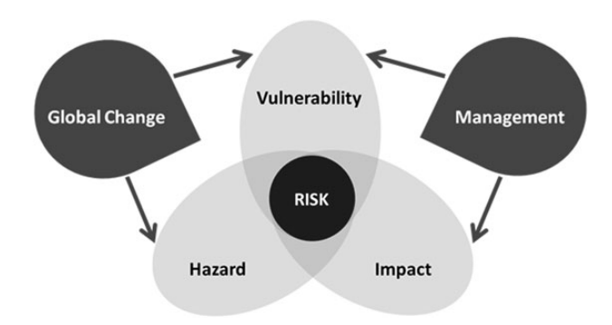
Figure 1 Risk depends on the combination of (1) the likelihood of hazard (e.g. frequency of wind, fire, pathogen, pest) which is the cause of damage, (2) the vulnerability of the system (e.g. forest stand) to the hazard thus resulting in damage and (3) the socio-economic impact of the damage (e.g. productivity loss) which depends on the value at stake (e.g. standing volume). Both global change and forest management can affect risk: global change mainly through change in hazard occurrence (e.g. spread of invasive species, higher frequency of storms) and forest vulnerability (e.g. water stress reducing resistance to pest) and forest management mainly through forest vulnerability (e.g. thinning improving tree vigour and thus resistance to pest) and impact of damage (e.g. short rotation forestry reducing standing volume).

mechanization of forest management which has increased the vulnerability of forests to disturbance from biological invasions, climate change and other stressors (Seidl et al., 2011). However, there is increasing recognition that forest management can be adapted to increase the resistance and resilience of forests to disturbance (Jactel et al., 2012b; DeRose and Long, 2014; Bahamondez and Thompson, 2016, this issue). The effects of global change and forest management on the risks to forests are influenced by the interaction of these drivers on the likelihood of hazard occurrence, the vulnerability of the system and the socio-economic impact of the damage as illustrated in the conceptual diagram presented in Figure 1.