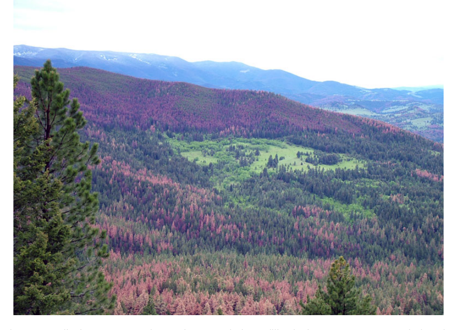
Figure 3 Bark beetle-caused tree mortality in western North America exceeded 11 million ha in a recent 13 year period. In the western US, Dendroctonus ponderosae was responsible for >50% of all tree mortality. As shown here in the US northern Rocky Mountains, Pinus spp mortality (red trees) due to D. ponderosae was spatially extensive and temporally synchronized.

warm winter events, however, could limit northward expansion of native and invasive species when winter acclimation is disrupted and metabolic reserves are depleted (Sobek-Swant et al. 2012). Although cold temperatures in some habitats could continue to limit population success, winter-breeding species or species that are not constrained by diapause and instead use plastic life history traits are predicted to do best in a changing climate (Sinclair et al., 2003). For example, the pine processionary moth (Thaumetopoea pityocampa), and the bark beetles Tomicus destruens, D. frontalis and D. ponderosae are documented to have taken advantage of thermal increases at multiple times of the year and become more active at higher elevations, or reaching new hosts and new areas further north than previously reported (Battisti et al., 2005; Faccoli, 2007; Weed et al., 2013).